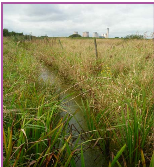
Halton Moss – Ideal water vole habitat